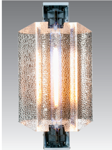
DE 1000Lh Reflector with lamp